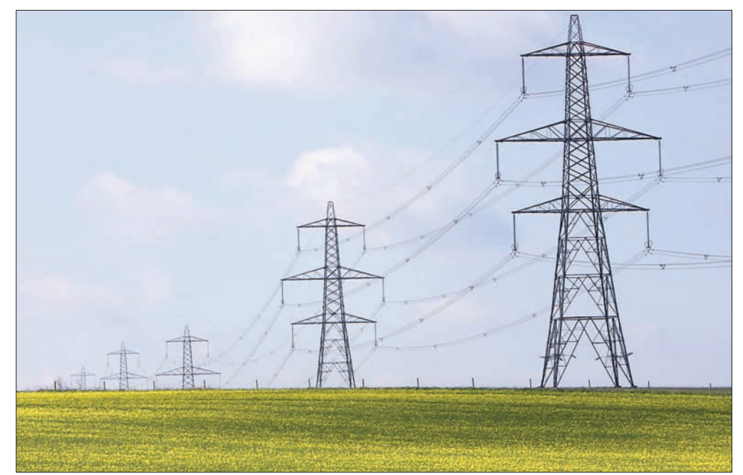
Public perceptions of pylons include links to poor health (not yet

"If none of the pylons are actually on the property but the